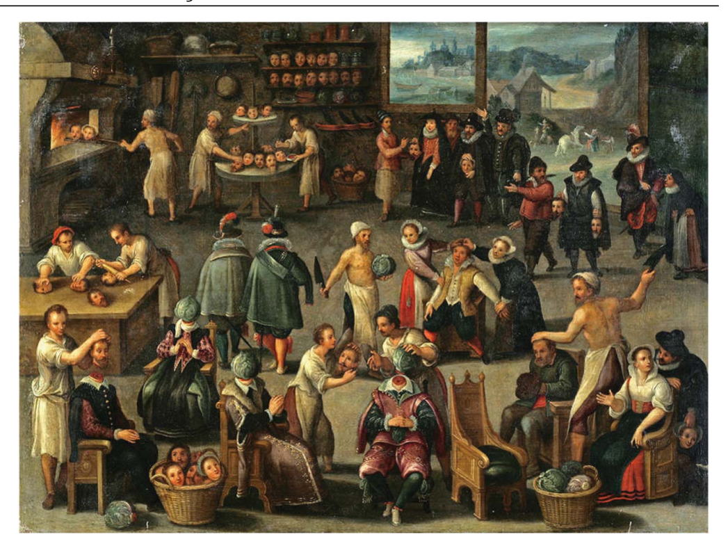
Figure 2. Cornelis van Dalem and Jan van Wechelen, The Baker of Eeklo , 1530-73. Flanders. Amsterdam, collection of the Rijksmuseum, currently on loan to the Muiderslot.

interdisciplinary level if they are inattentive to the conceptual and/or grand narratives that guide and inform them. ^{106}